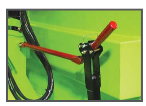
- Wing lock up -