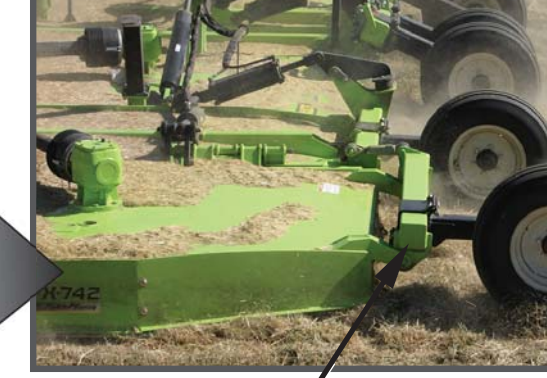
- Can accommodate 12 rows -