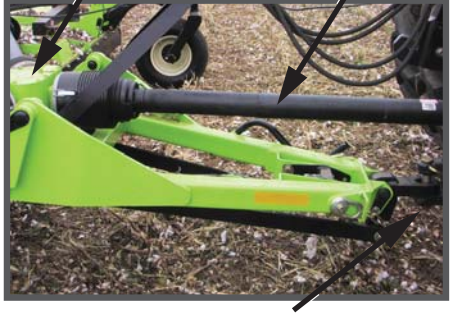
- Parallel solid tongue hitch -