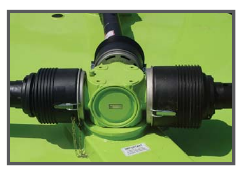
- 180hp divider box allows for unique driveline layout -