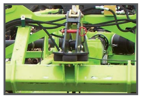
- Rubber grommet suspension -