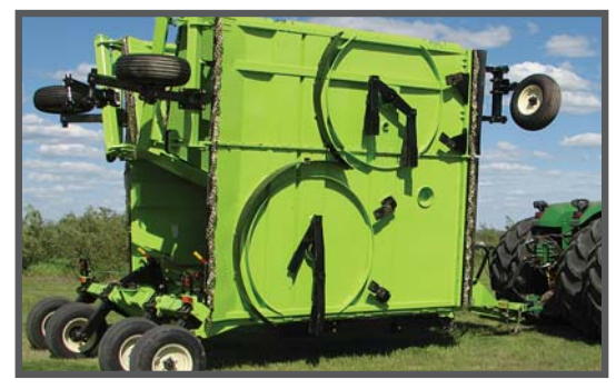
- Fixed knife unit shown above -