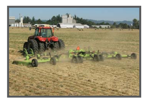
- In grass straw -