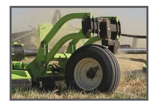
- Adjustable front castor wheels -