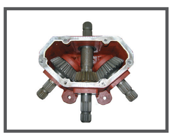
260hp heavy duty splitter box with I 3/4" splined shafts

Schulte Cutters are legendary throughout the mowing industry for being the toughest and most dependable. The FX-318 continues this renowned tradition at an economical price.