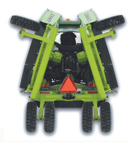
Ultra Narrow Transport Width