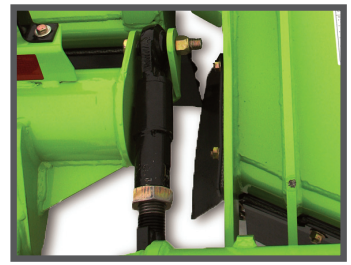
Heavy duty turnbuckles