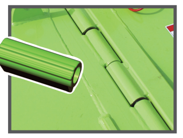
Heavy duty cast hinge line with wiper seals