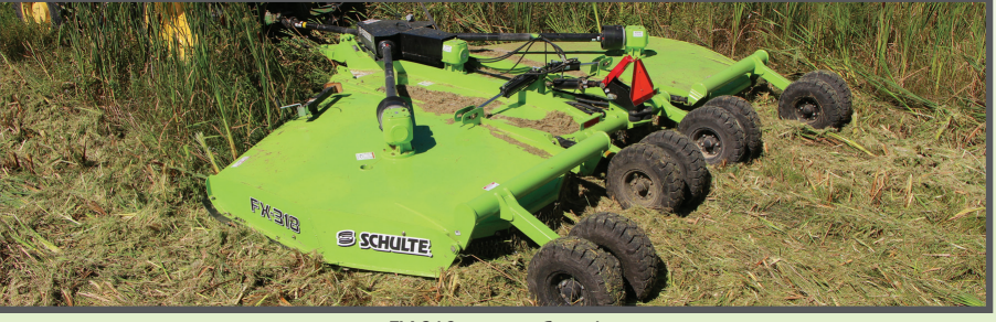
FX-318 mowing Cattails