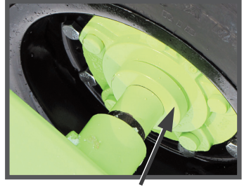
Metal seal guards on 517 hubs