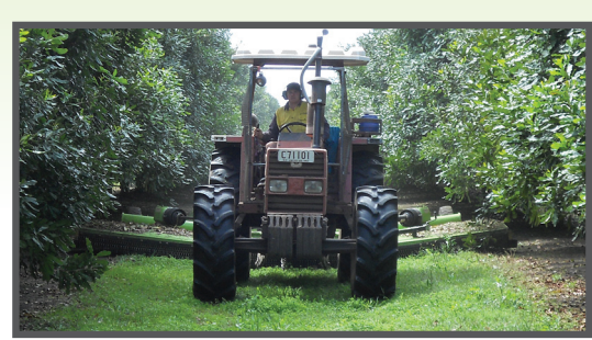
FX-318 mowing Macadamia Orchards

Category 5, European Size 6 13.63" (346mm) Rubber 3 puck grommet