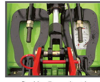
Dual levelling rods with floating hitch