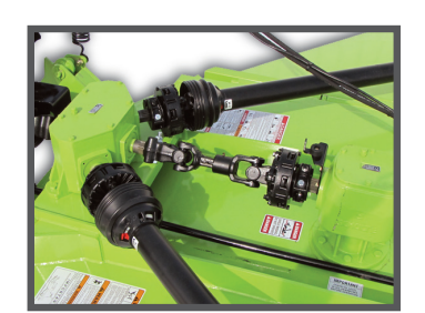
Heavy duty drive system for peak performance