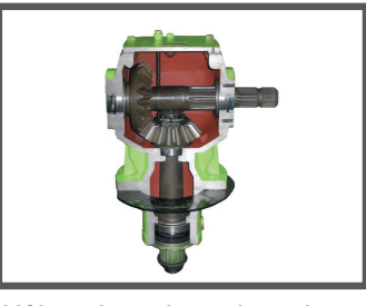
210hp right angle gearboxes heavy duty I 3/4" input shafts. 2 3/8" tapered & splined down shafts