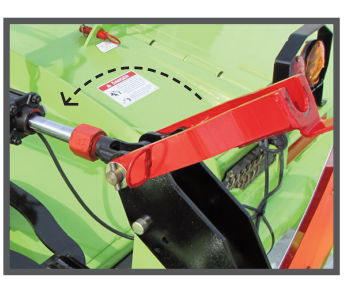
Single center lock up system