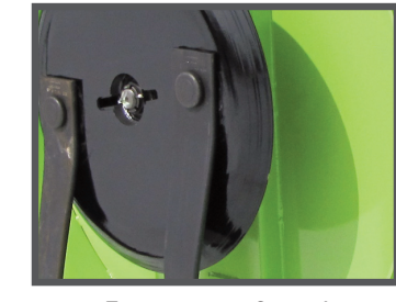
7 gauge spun formed stump jumper pans