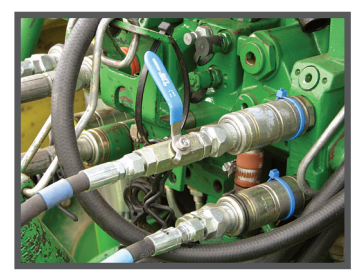
Ball valve wing lock uþ system