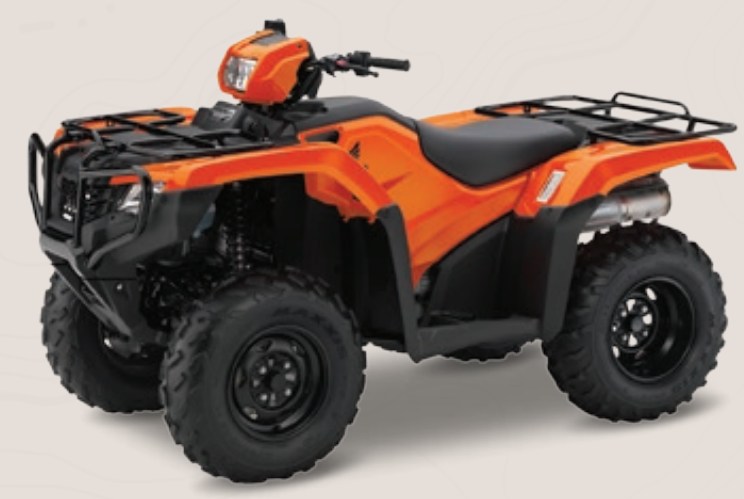
TRX500 Foreman ES EPS Model Shown

Choose the TRX500 Foreman with its tried-and-true fivespeed (plus reverse) foot-shift transmission, or step up to the TRX500 Foreman ES EPS with push-button Electric Shift Program and the many benefits of Honda's Electric Power Steering. Then get ready to discover what legendary performance can do for you.