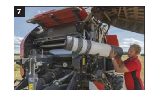
Support brackets for easy loading of the net roll