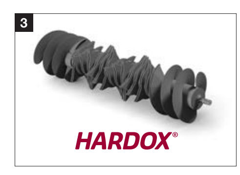
KUHN Integral Rotor with tines made out of Hardox® wear plates