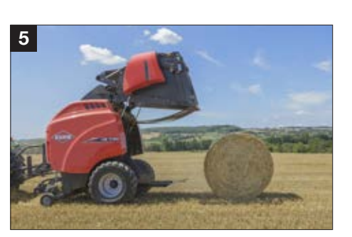
Within 4 seconds the bale is ejected and the tailgate is closed again