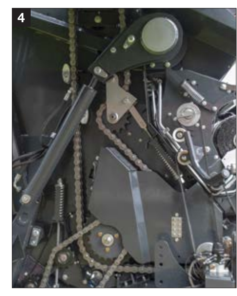
Robust driveline with wear-resistant and oversized chains