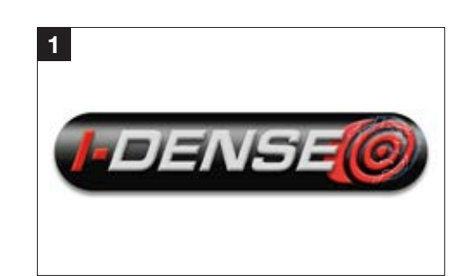
KUHN patented* i-DENSE system provides densities of up to 8.8 lb/ff³(140 kg/m³) in straw