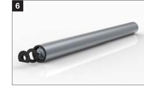
Seals on the idling rollers to keep crop contamination away