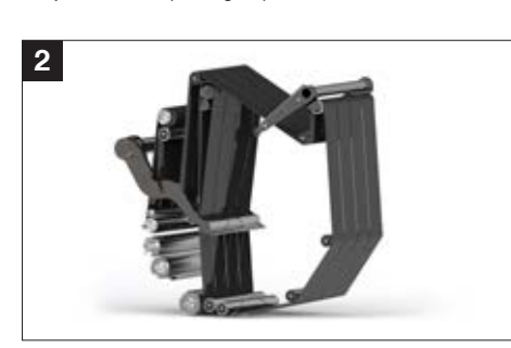
4 belt, 3 roller design of the bale chamber ensures fast, consistent bale formation in any crop condition