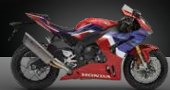
2021 CBR1000RR-R Fireblade SP