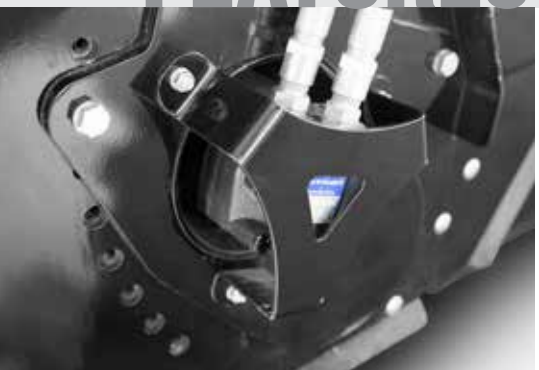
Motor Guard The guard protects the hydraulic motor from loose