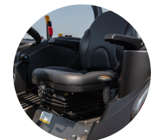
6. Comfortable Suspension seat