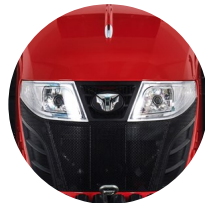
1. Hood design

A rugged Series 3 tractor that combines high performance with ease of operation for all your tough tasks. Perfect for intense jobs that demand productivity.