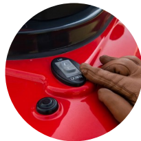
2. External hitch switch