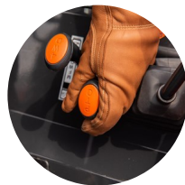
3. Ergonomic lever