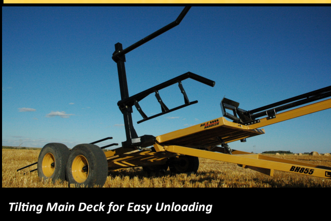
Tilting Main Deck for Easy Unloading

The LEON BH855 Bale Handler is a heavy duty built 'HYDRAULIC PUSH OFF' Unit designed to handle from 8 to 15 round bales in 48" to 72" width capacities. Featuring 'two row' or 'three row' capabilities, a heavy duty frame, and smooth HYDRAULIC PUSH OFF unloading technology, the LEON BH855 can transport both wet and dry bales. The service friendly, trouble free maintenance design allows for easy-handling to help farmers reduce handling costs while minimizing bale damage. Rated for 100++ HP tractors, key LEON BH855 Bale Handler features include: