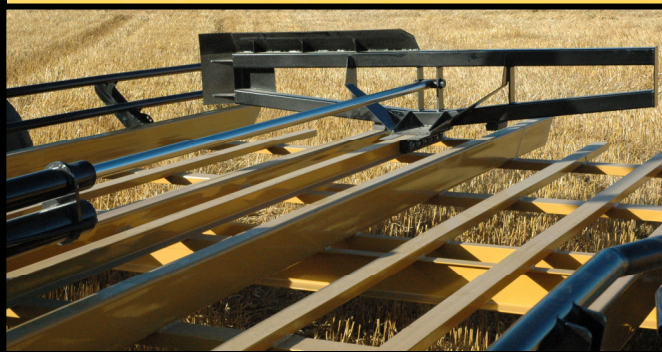
Powerful and Smooth Hydraulic Push Off Technology