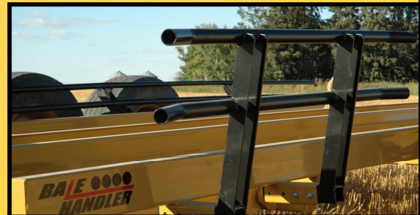
Side Rails Keep Bales Securely in Place