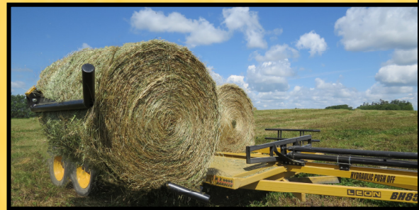
Adjustable Bale Lift Arm Picks Up Bales on the fly!

Specifications and features subject to change without notice.