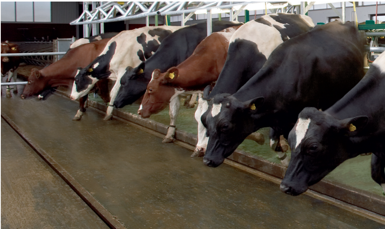
EuroClass 1200 RE

The breast rail with integrated indexing enables rapid yet perfect positioning of the animals. This saves time because the clusters are applied more quickly and milk is released more easily because the animals are more relaxed. Another bonus is the flexible height adjustment of the breast rail, which makes it adaptable to the various sizes of the different breeds.