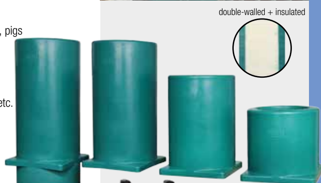
double-walled + insulated