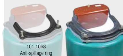
101.1068 Anti-spillage ring