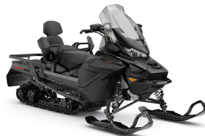
EXPEDITION LE 900 ACE TURBO R SHOWN