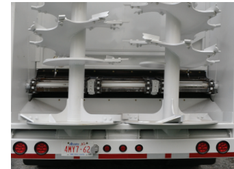
removable bumper, 5/8" beater fighting, 3 sets of wr78 floor chain w/rectangular tube cross slats

This machine is designed for off-road agricultural use only. For other applications, please contact J. Bond & Sons Ltd. J. Bond & Sons Ltd. reserves the right to improve or modify our product without notice or obligation.