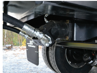
5,000 psi bent axis motor