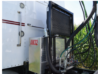
One simple, clean bulkhead for all air, hydraulic and power hook ups