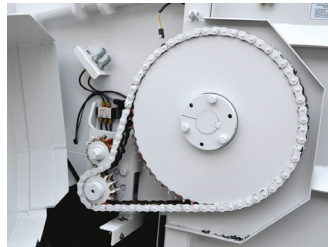
Duplex #80 chain for floor drive