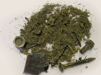
Actual tramp metal removed from magnet.