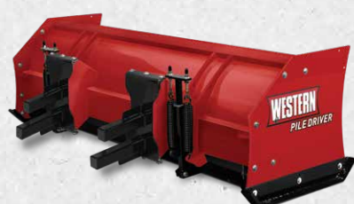
WHEEL LOADER/ BACKHOE ATTACHMENT PLATES