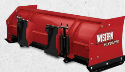
TRACTOR ATTACHMENT PLATES