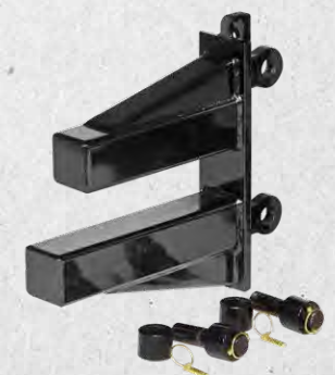
UNIVERSAL POST FOR WHEEL LOADERS