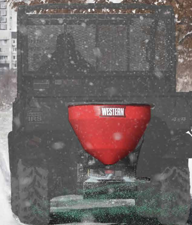
Shown with optional cover accessory.

This 3.0 cu ft poly hopper comes standard with a 2" receiver mount. Additional mounts available include a utility mount, drop utility mount, trailer mount and a 3-point mount.