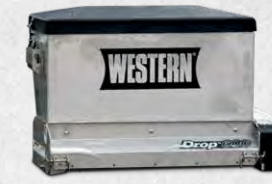
DROP™ 250 DROP™ 600