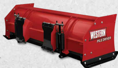
SKID-STEER ATTACHMENT PLATES

Consult your local WESTERN dealer or westernplows.com for accessory compatibility and availability.