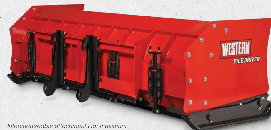
Interchangeable attachments for maximum versatility (wheel loader carrier option shown)

Floating shoes keep the cutting edge level on uneven surfaces to maintain a clean scrape.