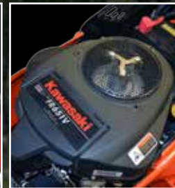
T2290 model (Powered by Kawasaki® engine)