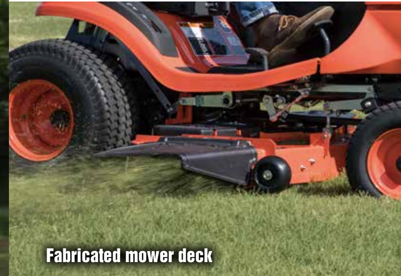
Fabricated mower deck

Step up to the Kubota T Series and get more of everything you want in a premium lawn tractor. More comfort to keep you relaxed and refreshed. More convenience to make the job easier. More efficiency to get the job done fast. And, of course, more Kubota dependability and durability to keep your T Series doing what the T Series does best: making your lawn look great.