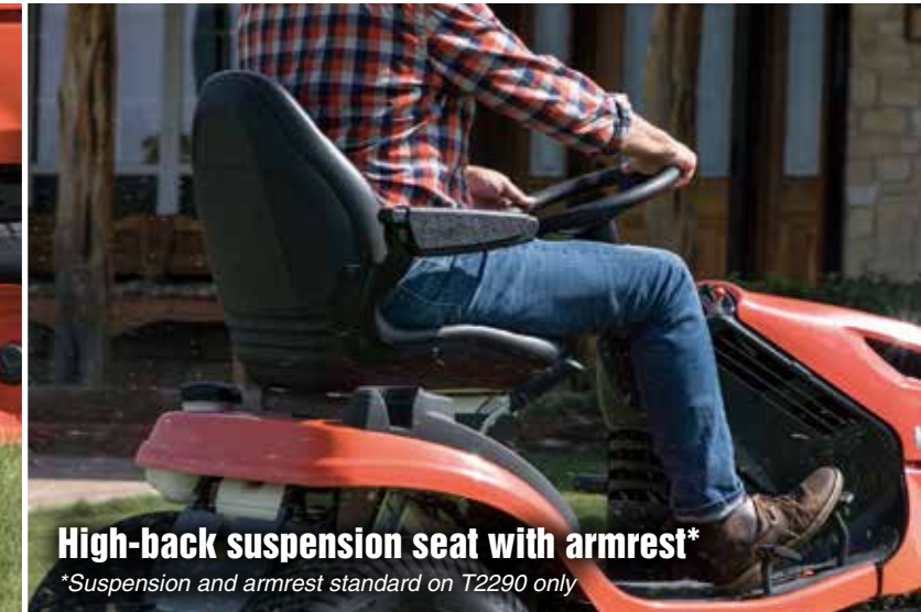
High-back suspension seat with armrest*

*Suspension and armrest standard on T2290 only