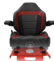
INTEGRATED SEAT ISOLATORS