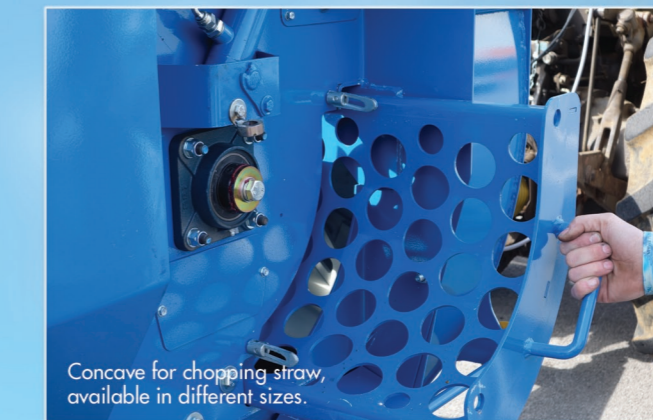
Concave for chopping straw, available in different sizes.

330, 450 & 475 range offer short chopping options in straw and will also distribute Hay and Silage for feeding. Straw can be just shredded for bedding or chopped short to a regular length as part of a feed ration or for bedding dairy cows and poultry housing. With the touch of a switch in the tractor cab the chopping mechanism is moved into the path of the straw flow to be chopped. The chopping mechanism is protected by shear bolts and flails that break back. Foreign bodies are collected in the trap at the rear of the machine.