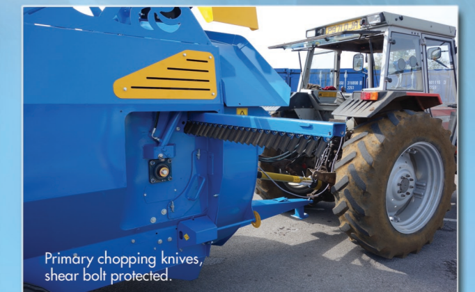
Primary chopping knives, shear bolt protected.