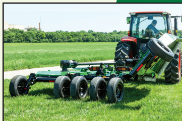
INDEPENDENT WING CONTROL