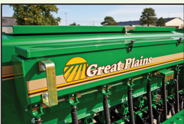
SMALL SEEDS BOX ATTACHMENT