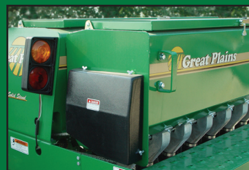
NATIVE GRASS BOX