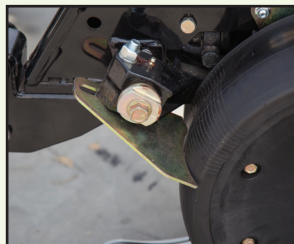
GAUGE WHEEL SCRAPERS