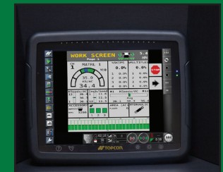
ISO-6 CONTROL SYSTEM