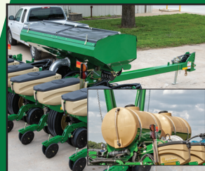
LIQUID OR DRY FERTILIZER