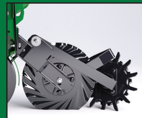
COULTERS & ROW CLEANERS