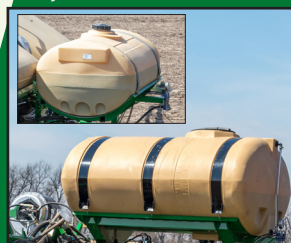
LIQUID FERTILIZER (400-GAL OR 600-GAL)