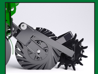
COULTERS AND ROW CLEANERS