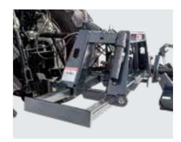
Retractable Weight Bar