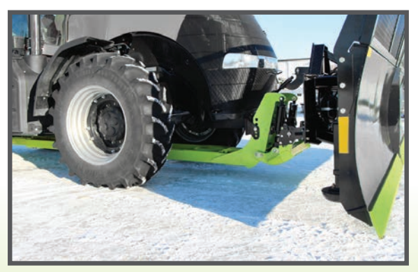
- FM-350 with SV Plow -

Enjoy the convenience, comfort and improved performance of a front mounted snow blower. No matter how much snow you need to move you will appreciate the FM-350. The FM-350 gives you the ability to mount your 3pt snow blower or SV Plow on the front of your tractor instead of on the tractor's rear 3pt hitch. The FM-350 offers you better visibility and ergonomics when coupled with a Schulte Snow Blower. Blowing snow while driving forward, is more efficient than blowing snow in reverse. The FM-350 allows you an increased selection of travel speeds, as your tractor has many more forward gears then reverse gears. This increased gearing selection will result in better snow blowing performance and less wear and tear on the tractor clutch, and your neck.