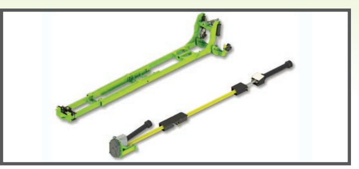
- Rear Hitch or Optional Drivetrain -

Simple attachment and removal from your tractor. A wide selection of proven tractor mounting brackets are available, for new, or older tractor models. A compact Category 2, 3PT lift mechanism ensures