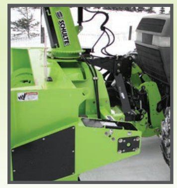
- Draw Bar Mount & PTO Power -