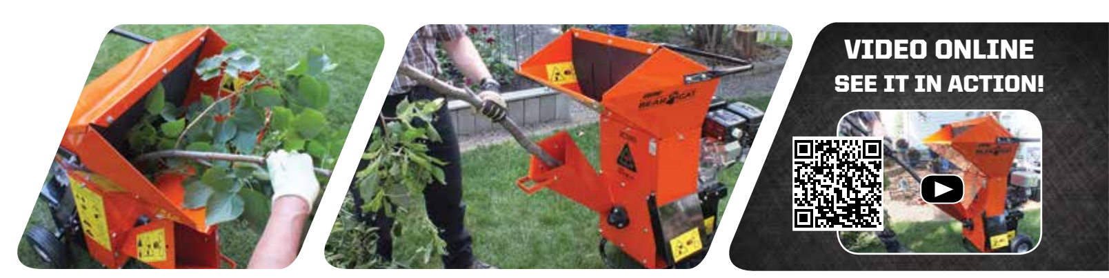
Diamond-shaped chipping chute accommodates irregular-shaped material