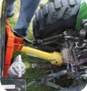
3-point hitch mount hook up