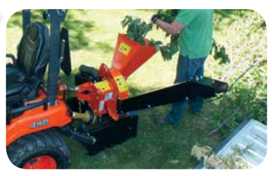
Optional truck loading discharge chute available for CH45540