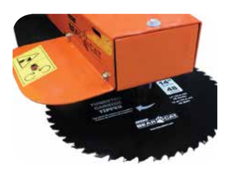
Optional 14" Sabre Tooth Blade