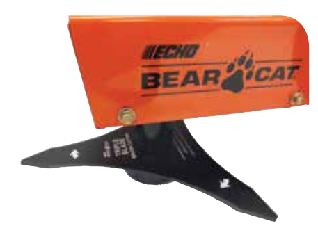
Optional 14" Triple Blade Brush Cutter