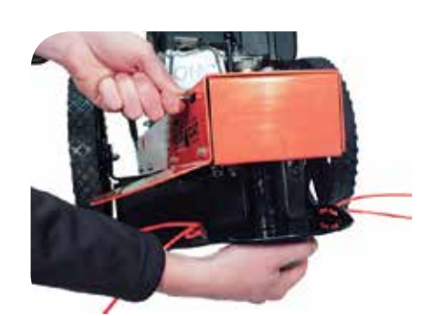
Easy conversion to options