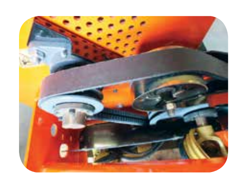
Double-banded belt drive