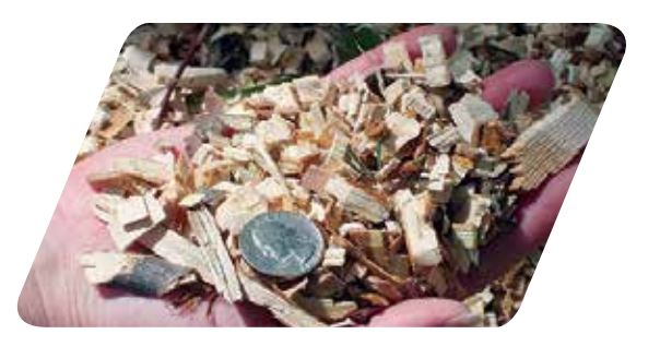
Making your own mulch has never been easier