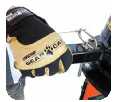
360° rotating discharge chute is easily adjustable