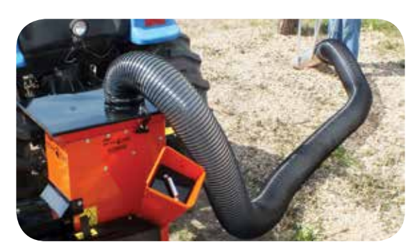
Shown with optional vacuum and blower kit