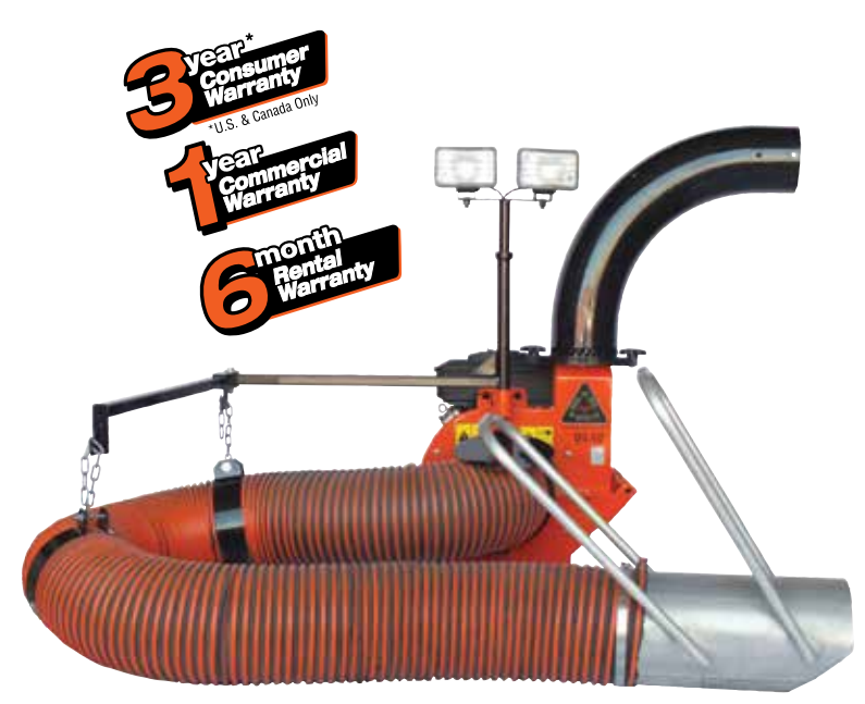
Shown with optional light kit

An ECHO Bear Cat Debris Loader allows commercial operators and municipalities to quickly collect leaves, grass or other light debris as efficiently as possible.