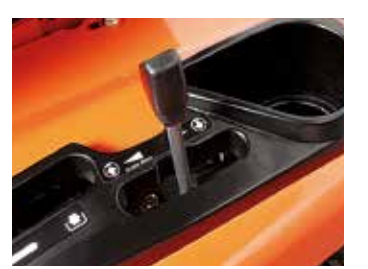
Hydraulic mower lift lever