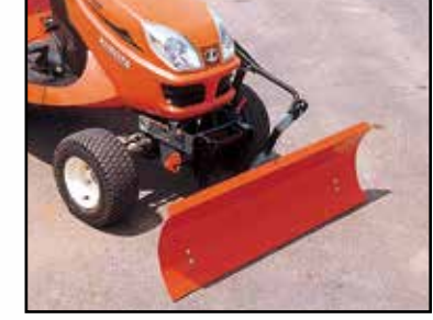
48" Front Blade (GR2705)