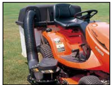
Grass Catcher (GCK54-GR)