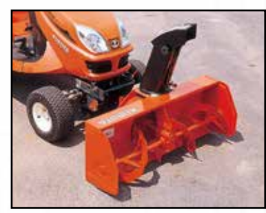
46" Snow Blower (GR2707)