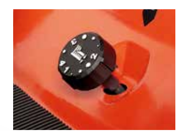
Easy reach cutting height adjustment dial

All GR mower decks are constructed of durable 10-gauge steel and designed with a 5-inch deep shell to assure professional and lasting results. And with an easy to reach cutting height adjustment dial and hydraulic mower deck lift, your professional results just became easier to manage. For even finer clippings, an optional mulching kit is also available.