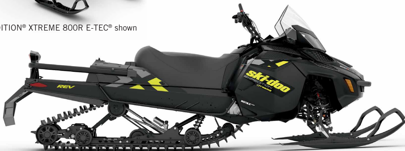
EXPEDITION® XTREME 800R E-TEC® shown