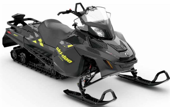
EXPEDITION® XTREME 800R E-TEC® shown