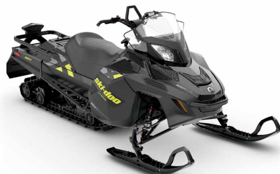
EXPEDITION® XTREME 800R E-TEC® shown