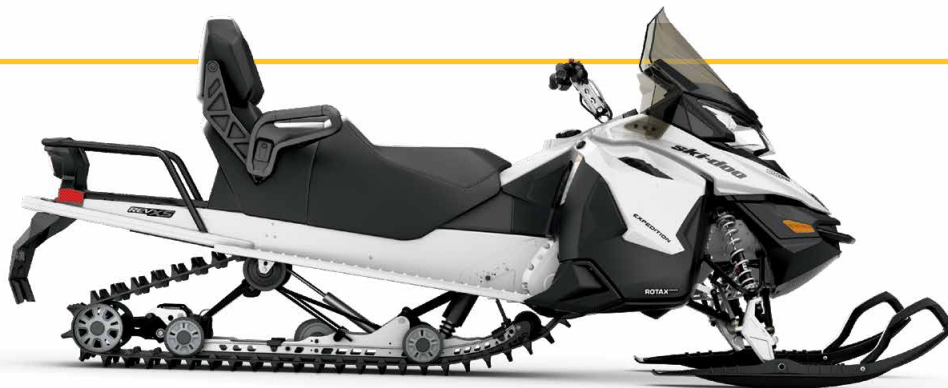
EXPEDITION® SPORT 600 ACE™ shown