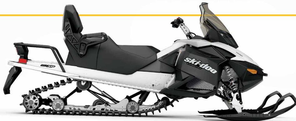
EXPEDITION® SPORT 550 Fan shown