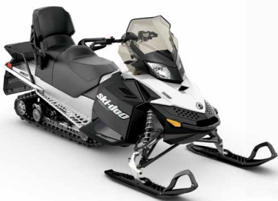
EXPEDITION® SPORT 550 Fan shown