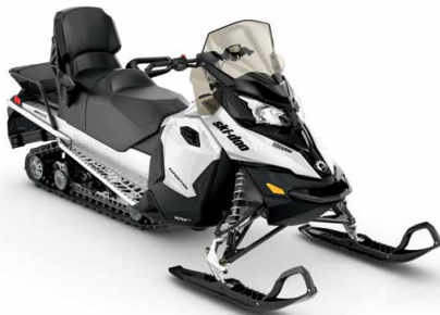
EXPEDITION® SPORT 600 ACE™ shown