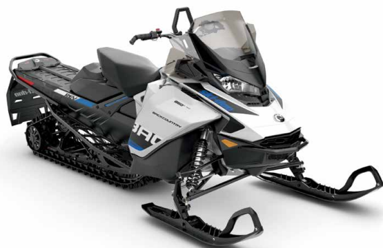
BACKCOUNTRY™ 850 E-TEC® shown