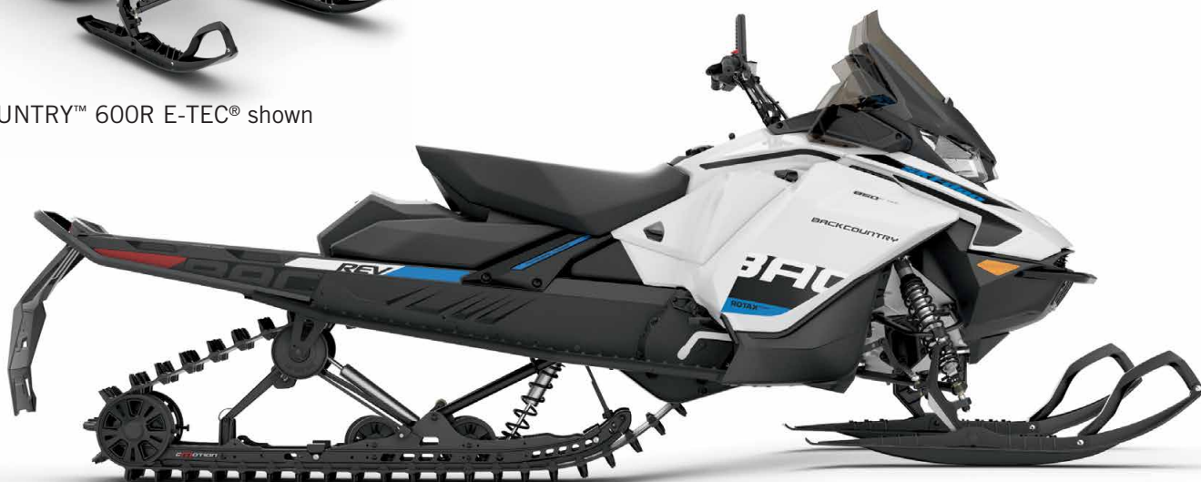
BACKCOUNTRY™ 850 E-TEC® shown