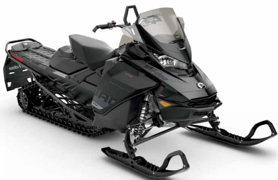
BACKCOUNTRY™ 600R E-TEC® shown