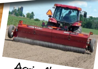
Agricultural & Landscape Seeders