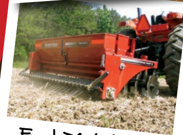
Food Plot Seeders