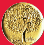
JAPAN QUALITY MEDAL 2007