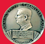
DEMING PRIZE 2003