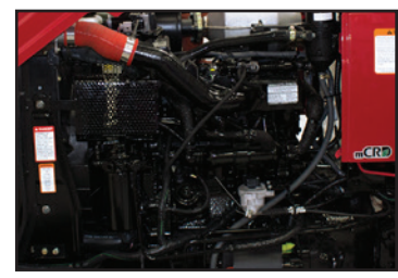
Engine - left side view