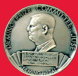
DEMING PRIZE 2003