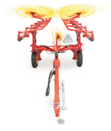
Field operating position Folded for narrow transport