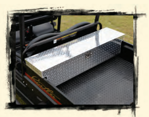
Cargo Bed Toolbox