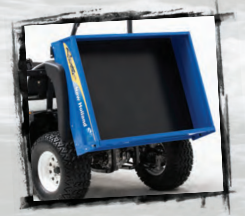
A bed box that's the largest in the compact class—20% more than some competitor models—means you can haul larger loads.

Independent rear suspension — a feature not available on most vehicles of this size — ensures you get a smooth ride. The best-in-class nine-inch ground clearance also allows you to easily handle rough, uneven terrain.