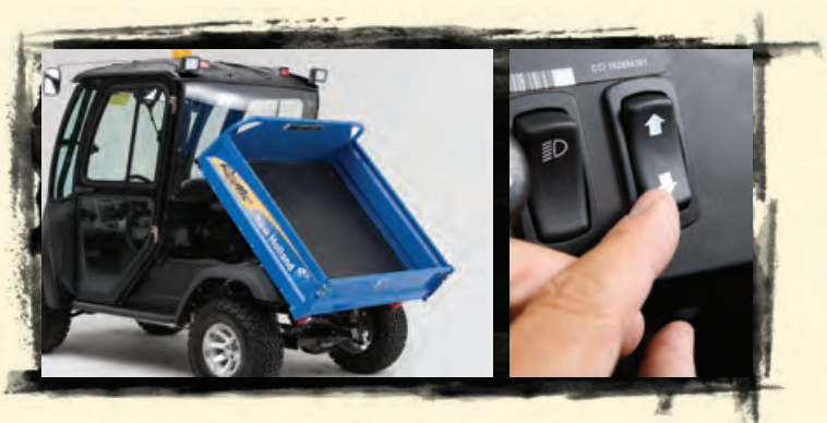
Electric Bed Lift (shown with Bed Mat)