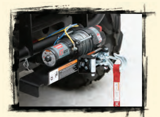
Warn Winch Kit, 2500 lbs.