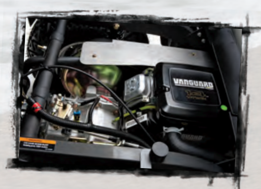
Large-block, V-twin engine boasts 20% more displacement, 8% more horsepower and more torque than other vehicles in the same class, so you put more muscle to work for you.