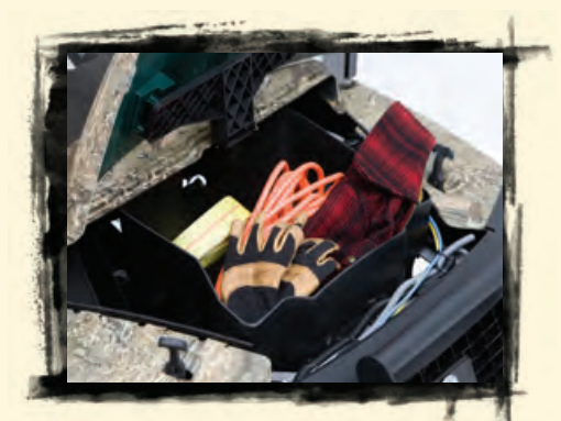
Under-hood Storage Box (gas models only)