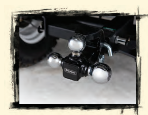
Triple Ball Pintle Hitch