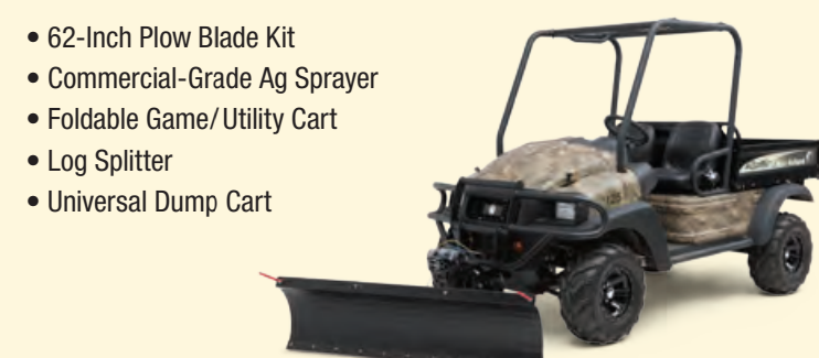
For a complete list of available attachments and accessories, see your local New Holland dealer.