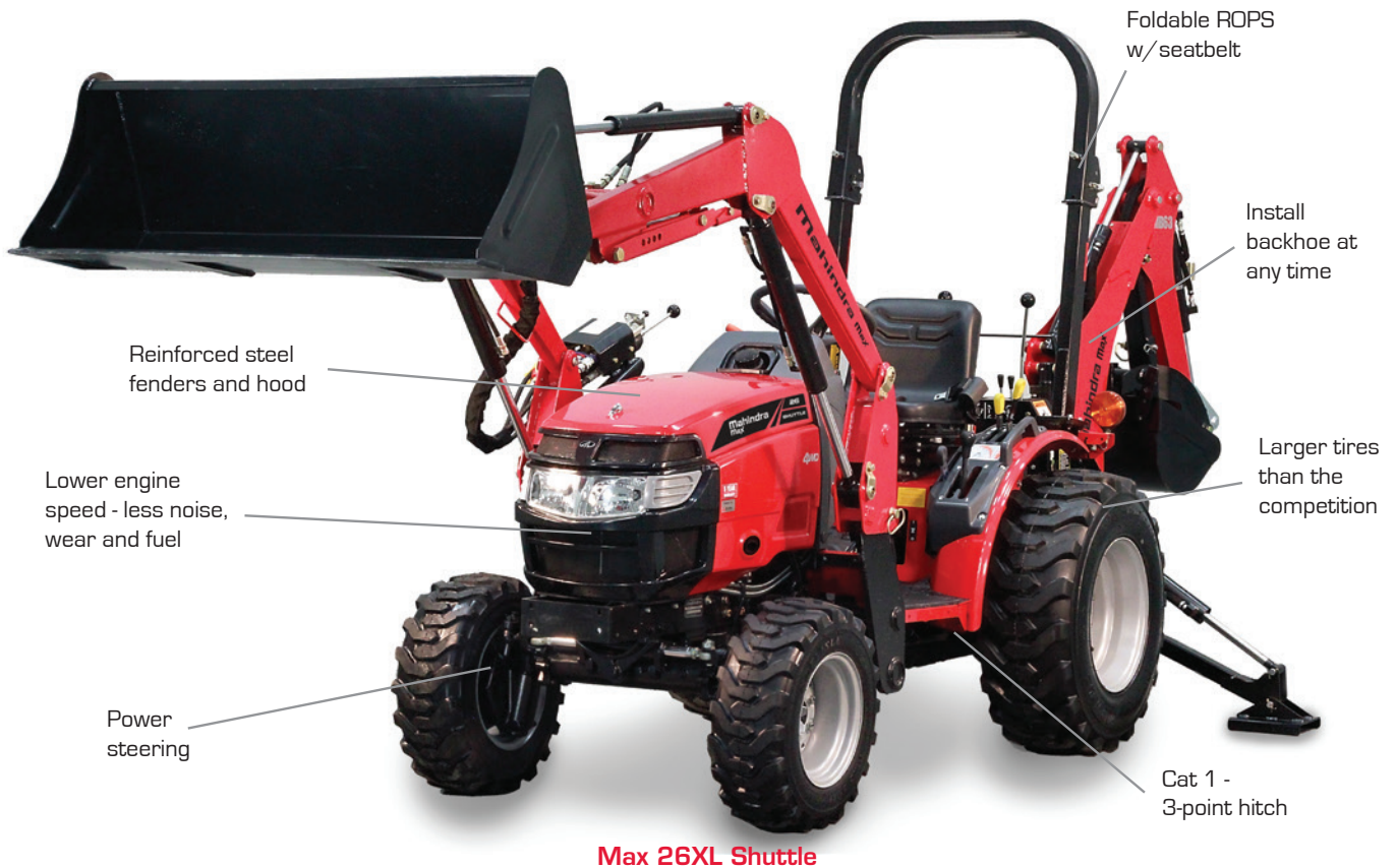
Max 26XL Shuttle

Warranty - 7-year limited powertrain (See Mahindra warranty and your dealer for details)