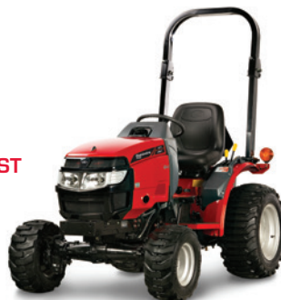
Max 24 HST