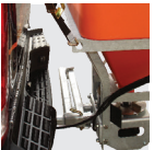
SWING AWAY MOUNT*