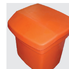
SALT BOX (6 CU.FT.)