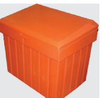
SALT BOX (9 CU.FT.)