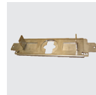
FLOW GATE 2