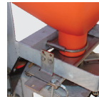
FLOW GATE 1