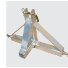
3 POINT HITCH