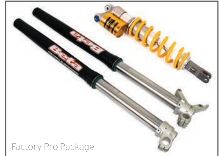
Factory Pro Package