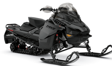
MXZ ADRENALINE WITH BLIZZARD PACKAGE 600R E-TEC SHOWN

High-tech features and racing DNA for hardcore trail riders.