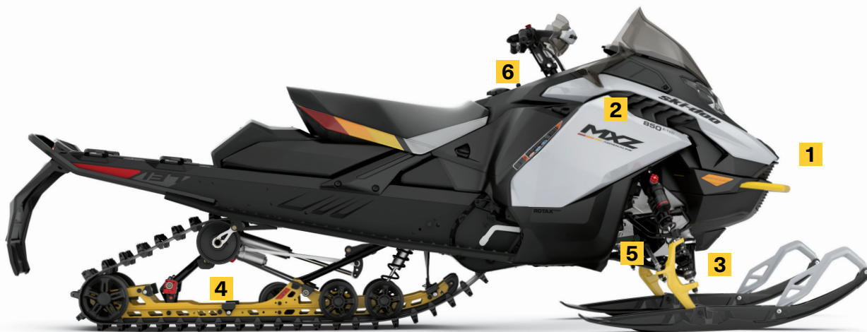
MXZ ADRENALINE WITH BLIZZARD PACKAGE 850 E-TEC SHOWN

KYB Pro 36 Easy-Adjust front and rear shocks featuring compression adjustment. HPG Plus center shock. All four shocks are aluminum and rebuildable/revalvable.