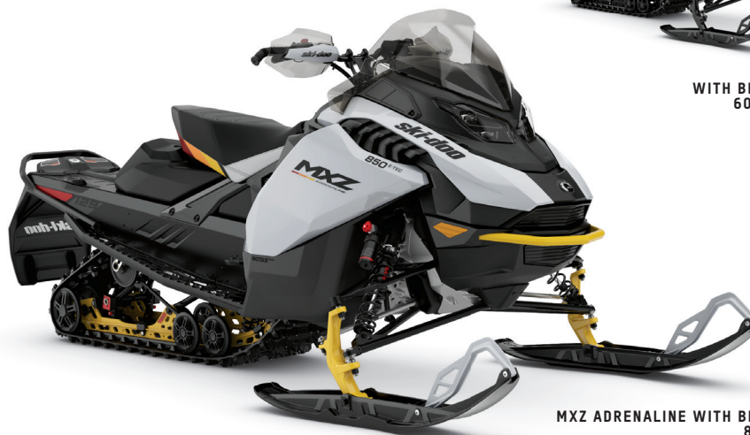
MXZ ADRENALINE WITH BLIZZARD PACKAGE 850 E-TEC SHOWN