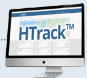
The optional HTrack™ program transfers spreading data via mobile network