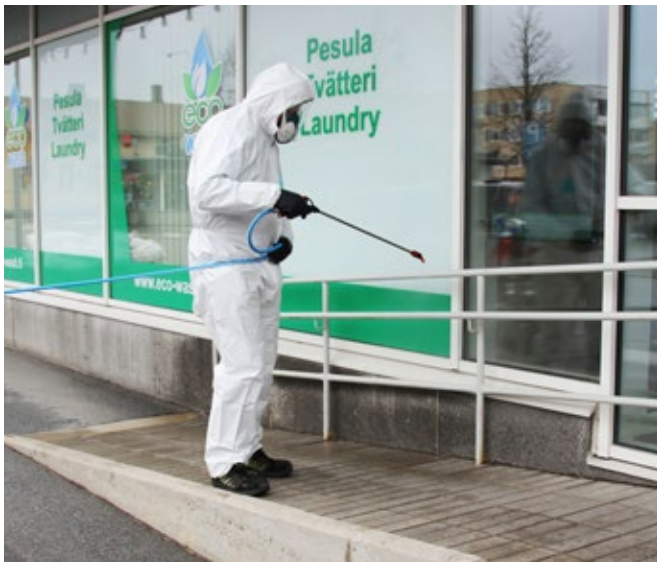
Optional hose reel for hard-to-reach areas