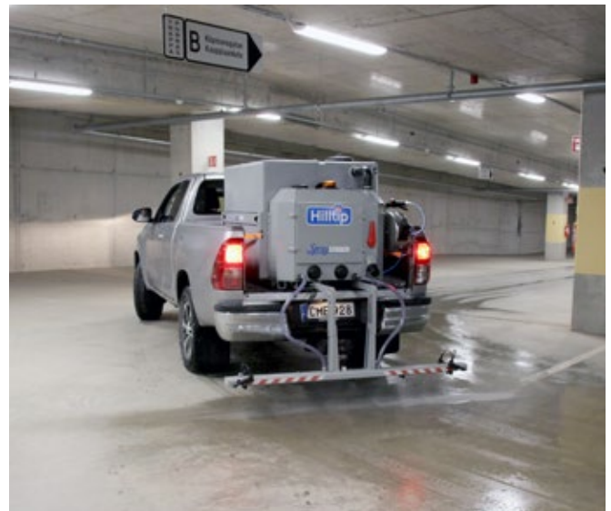
SprayStriker™ 1000 liter