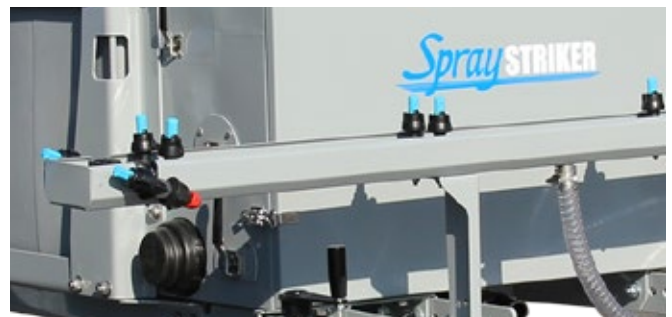
Double spray nozzles