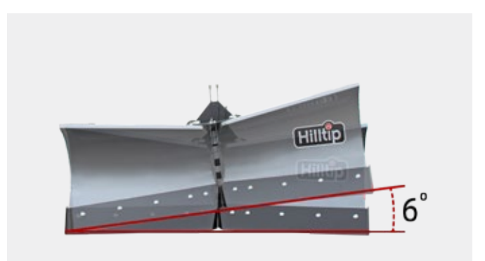
6° tilt angle