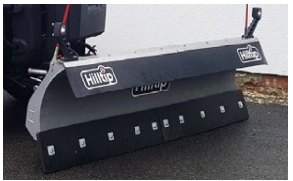
Optional snow poly deflector.