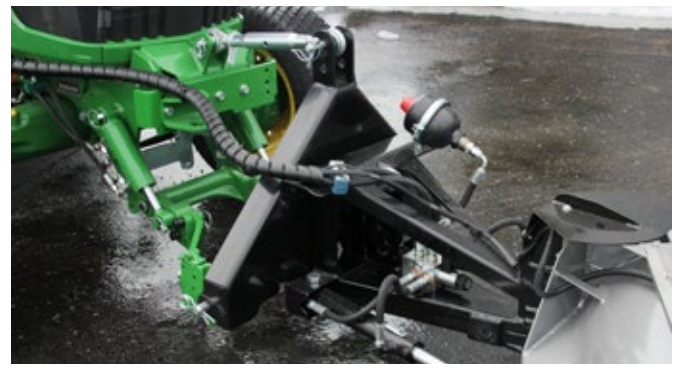
3 point hitch for tractors.