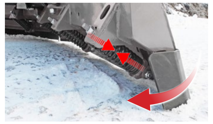
Cutting edge with trip springs