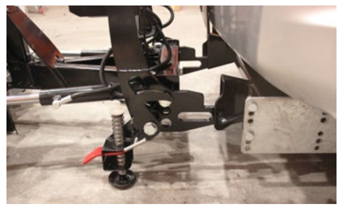
Quick hitch - lift shoe handle to attach your plow to the vehicle.