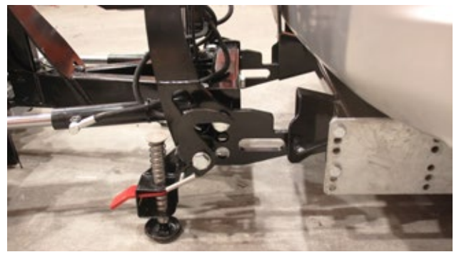
Quick hitch - lift shoe handle to attach your plow to the vehicle.