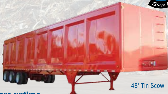
48' Tin Scow